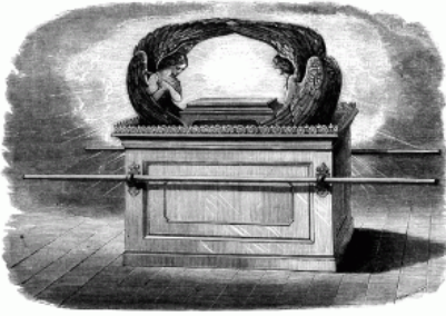
THE ARK AND MERRY MEAT

First, only Israel was going to be dealt with in relationship to that ark. When that ark would get in the hands of any other people who did not know what it really meant, there was no benefit for them in it at all. That is exactly like a sinner trying to go to church, trying to look good, yet refusing to accept Jesus Christ into his life and be made a new creature. He had just as well go out and sell peanuts on a street corner. He will benefit more by something like that than he will by sitting in a church somewhere with true Christians, thinking he will be blessed just like anyone else. That ark was never supposed to be a blessing to a bunch of pagan unbelievers. When you read the story, how the Philistines took the ark back into the land of the Philistines, look what happened: They had a god by the name of Dagon. They brought this ark and placed it before their god; and at that time, we realize, God still looked upon the ark as an important item in respects to His relationship to the people who had lost it. At that time it was very important. When the Philistines had placed it there, what did they find the next morning? Something had caused the statue of Dagon to fall flat on its face. The head was broken off, and the hands, and certain other parts. The Philistines looked at that and begin to realize they did not want that strange looking box